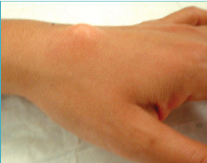
Figure 1 (top): A ganglion on the top side of the wrist

A ganglion cyst is a lump at the hand and wrist that occurs near joints or tendons. It may be described as a mass, swelling, or bump. Ganglion cysts are common. They are frequently found in common locations and are often seen on the back of the wrist in the middle. They can also be near a finger joint. When they are on the palm of the wrist, they are typically off-center toward the base of the thumb (see Figure 1). They may also be felt at the base of the finger on the palm side. They are sometimes seen on the fingertip (near the end joint) on the back of the finger (see Figure 2).