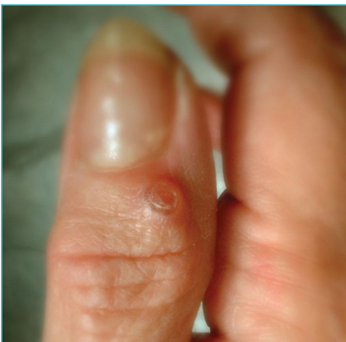
Figure 2 (bottom): A ganglion cyst at the end joint of the finger, also known as a mucous cyst

The ganglion cyst may be filled with a clear, gel-like fluid. It can be thought of as a water balloon on a straw (see Figure 3). The straw is connected to a joint or tendon sheath. Joints and tendon sheaths normally produce fluid. This fluid production may cause the cyst to increase or decrease in size. Some cysts may disappear completely over time. A ganglion cyst is not cancerous and will not spread to other areas.